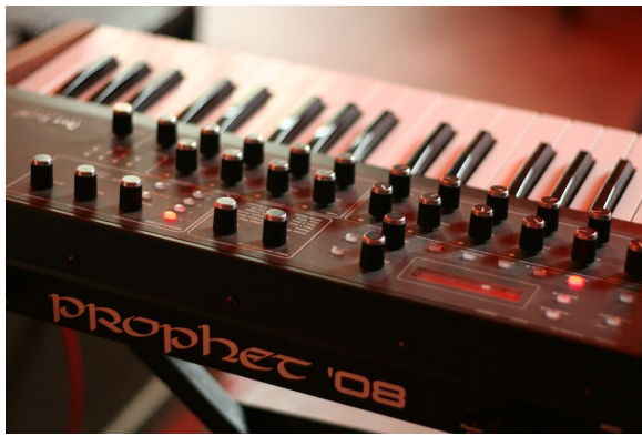
Figure 2: Dave Smith Instruments Prophet '08.