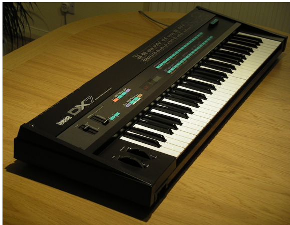
Figure 6: Yamaha DX7.