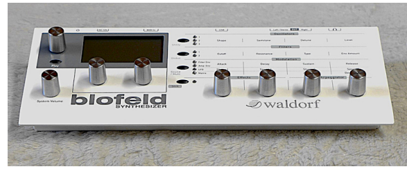
Figure 7: Waldorf Blofeld.