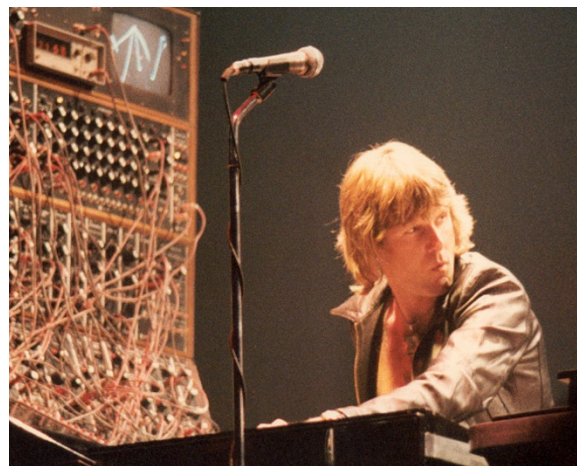
Figure 1: Moog modular synthesizer being played by Keith Emerson. Note the vertical modules with knobs and patch cables.

This paper is organized as follows. Section 2 introduces the notion of patch editors. Section 3 is a tutorial on MIDI and System Exclusive. Section 4 introduces a music synthesizer’s memory model, and Section 5 discusses common interactions with a synthesizer needed to build a patch editor for it. Sections 6, 7, and 8 offer case studies for three classic synthesizers, the Yamaha DX7, the Dave Smith Instruments Prophet ‘08, and the Waldorf Blofeld, which illustrate how MIDI is used, how their internal models differ, and the challenges of writing software to work with each of them. Section 9 details the very wide range of absurd decisions made by manufacturers which unnecessarily complicate the development of patch editors for their products and which you will almost certainly encounter. Finally Section 10 laments recent trends in synthesizers which portend the end of tools to assist them for the benefit of the community.