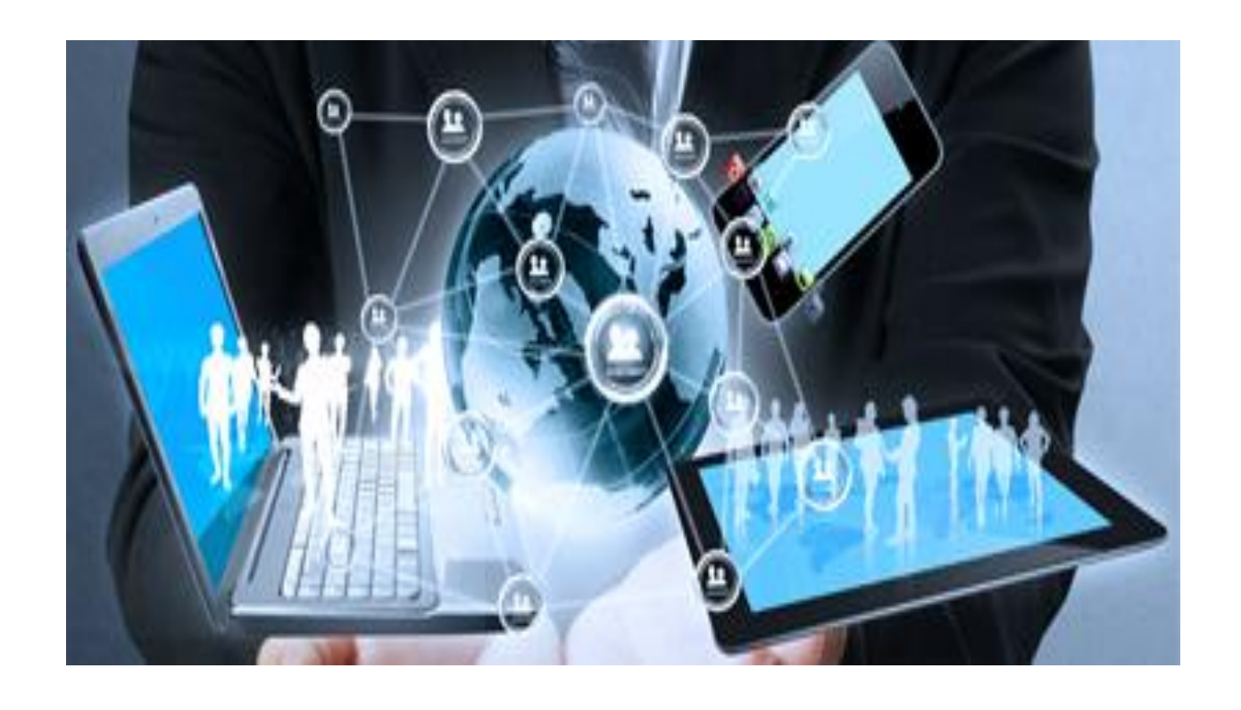
The Better Way of Managing and Leading Software Projects